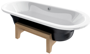
Oval steel bath with platform set in natural american oak wood and optional anti-slip base.